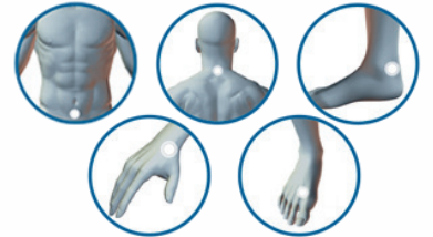
• Patented form of phototherapy