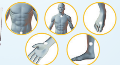
• Patented form of phototherapy